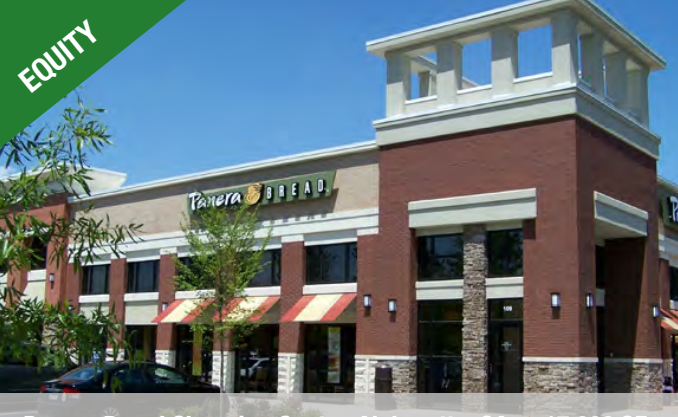
Panera Bread Shopping Center, Alpharetta, GA 🔶 17,000 SF