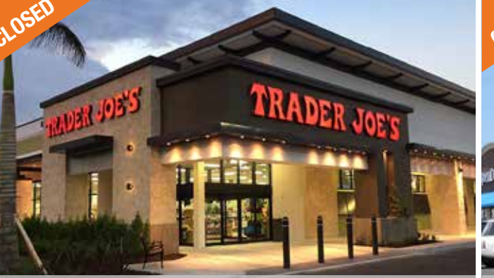
Trader Joe's/Vitamin Shoppe, St. Petersburg, FL 15.500 SF. Built in 2014