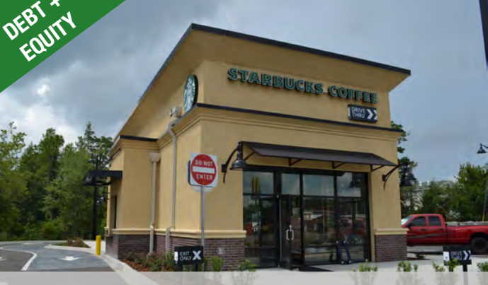
Starbucks, St. Augustine, FL 🔶 1,838 SF