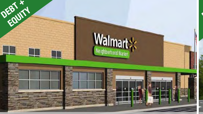
Walmart Neighborhood Market Ground Lease Orlando, FL • 41,921 SF