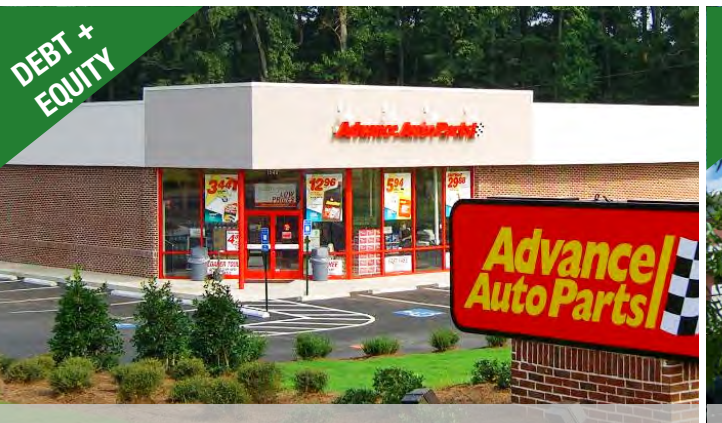
Advance Auto Parts, Atlanta, GA 🔶 7,000 SF

Wesley Commons (Publix Anchored), Tampa, FL 🔷 53,785 SF